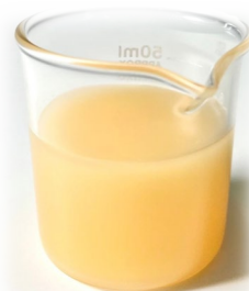
▲ Sirayash Plantix® Oryza