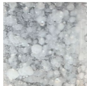
▲ Snow-Like Shape

When added this ointment Plantix Oryza to the toner formula, it will form a beautiful snow-like shape . Its compatibility can fit in all types of formulas for the maximum application diversity .