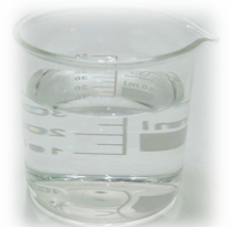
▲ HermoCos P6