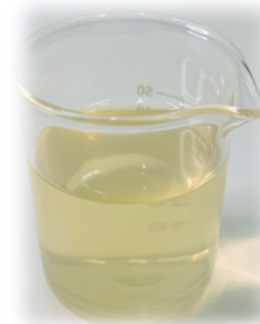
▲ Sirayash Plantix® Mala' afihay