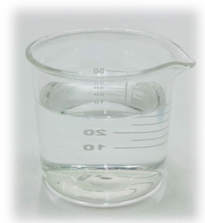
▲ Sirayash Plantix® Vituna